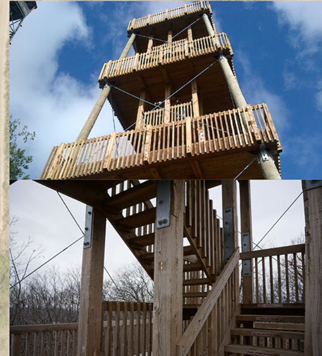
F BIRD VIEWING BLINDS