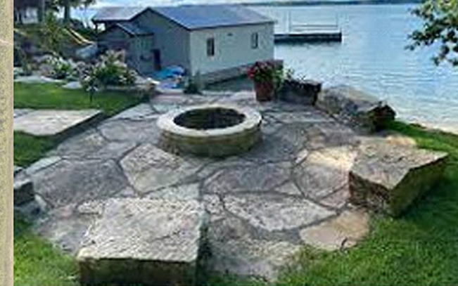
C SEASONAL AMENITIES