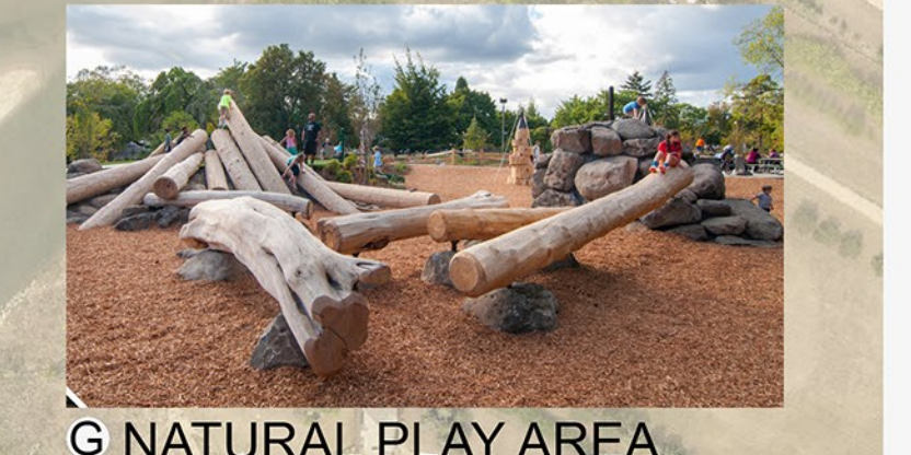
G NATURAL PLAY AREA