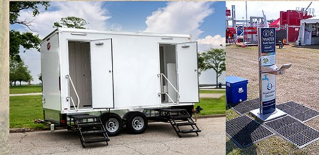
D TEMPORARY DOCK