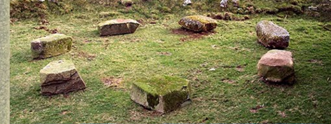
B SEATING CIRCLE