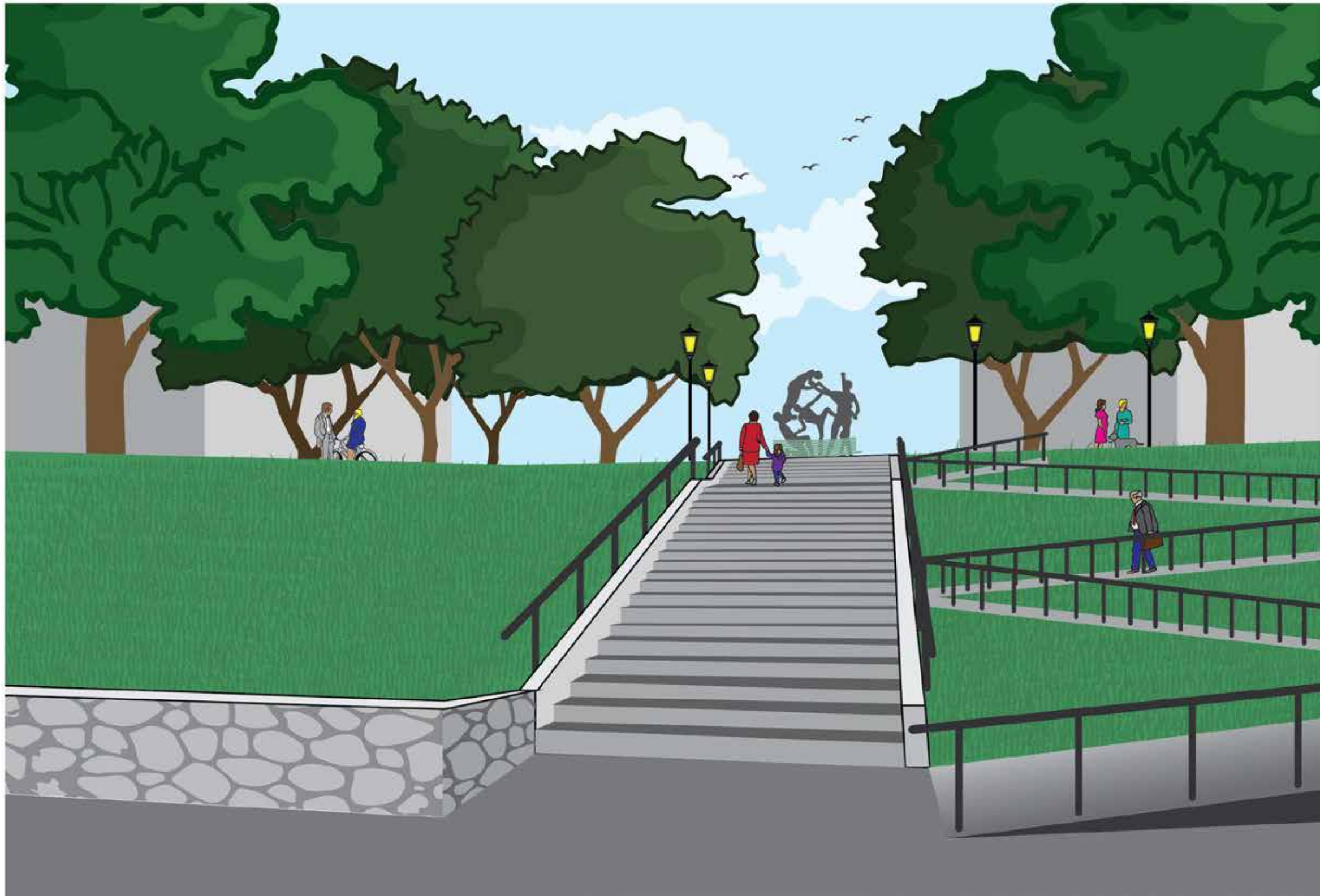
DOWNTOWN TRAIL AND SITE ENHANCEMENTS: Kiwanis Memorial Park North Conceptual Illustration