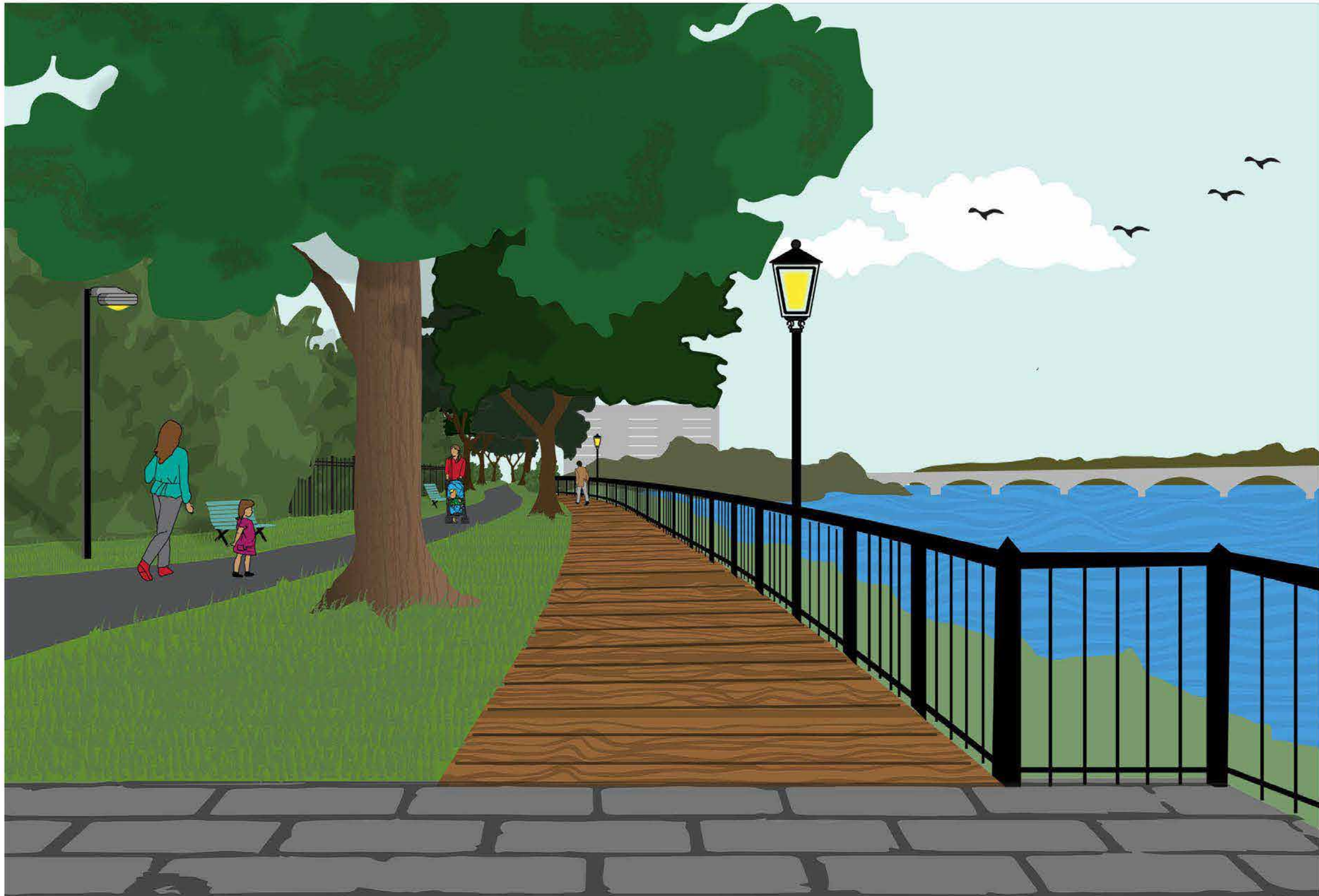
DOWNTOWN TRAIL AND SITE ENHANCEMENTS: Kiwanis Memorial Park Central Conceptual Illustration