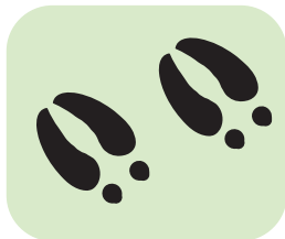
Mule Deer Track