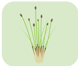
Creeping Spike Rush

Use your wild eyes to spy these aquatic plants and creatures while exploring the Meewasin Valley!