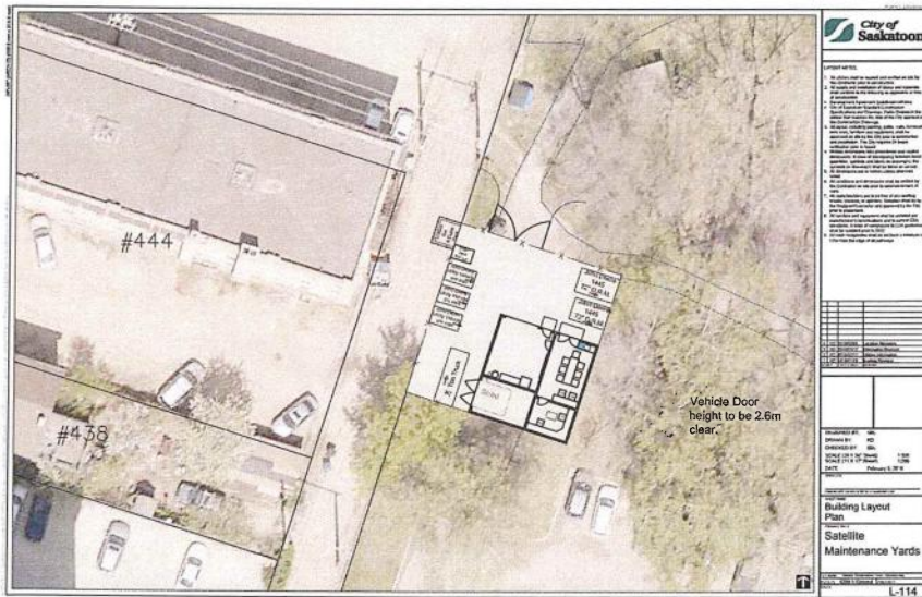
Conceptual drawing of Satellite Maintenance Building at Kinsmen Park.

West end of park off the 5 th Avenue alley.