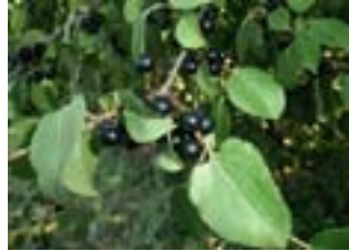
European Buckthorn

European Buckthorn ( Rhamnus cathartica ) is an invasive shrub designated as noxious in Saskatchewan by the Ministry of Agriculture. Being designated noxious means that landowners, both urban and rural, have a duty to control these plants on their property. European Buckthorn is a small shrub or tree originating from Europe that grows up to 8 m tall with sharp thorns. Its leaves are green, smooth, elliptic with finely toothed edges, usually opposite. The leaves are one of the last to turn in the fall, appearing green well after many other trees and shrubs have dropped their leaves. It is typically found in even-aged and dense stands in the understory, under the fruit-bearing females, and crowding out the native vegetation. European Buckthorn was brought in as a shelter belt species to the Dominion Forestry Farm in the 1930s, but has since spread and is found growing wild throughout Saskatoon and the river valley. If you find Buckthorn in your yard, you can prevent its spread by planting native shrubs and/or spreading mulch in the understory to suppress germination of seeds to outcompete, as well as removing the berries and incinerating or bagging. To control this plant, you can repeatedly hand-pull or dig small shrubs, cut back repeatedly, cut and treat the stump to stop suckering, or use a recommended herbicide that is suitable for the task.