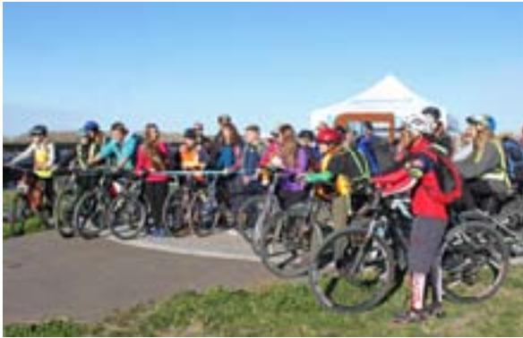
St. Edward School EcoJustice Class, first to officially ride the new Meewasin Trail section to Chief Whitecap Park.