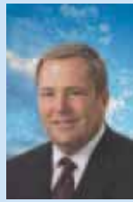
MAYOR DON ATCHISON