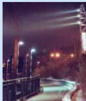
Reality Executives Boardwalk illuminated by the Credit Union Light Tower