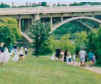
Saskatoon Credit Union Families cleaning up the River Valley

Meewasin's jurisdiction centres in Saskatoon and runs approximately 60 km along the river through Saskatoon and Corman Park from Pike Lake in the southwest to Clarke's Crossing in the northeast. It encompasses conservation areas, parks, museums, interpretive centres, the university lands, canoe launches, community links, and over 60 km of Meewasin Trail. Including the South Saskatchewan River, there are 25 square miles in the Meewasin conservation zone.