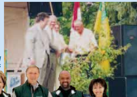
Meewasin Trail Ambassadors