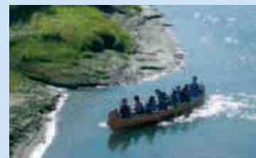
SIGA Canoe Tours of the river