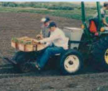
Meewasin Summer Students Planting