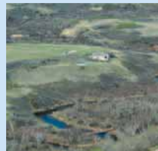
Beaver Creek Conservation Area