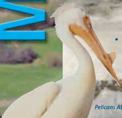
Pelicans At The Weir