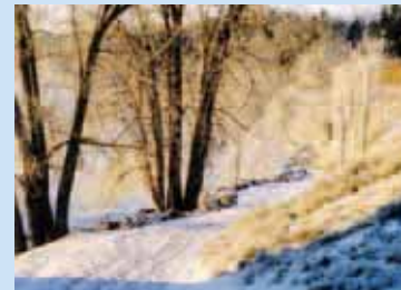
Kinsmen Fishing Platform Trail 2004