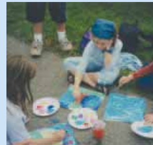
Children painting during Day-At-The Park