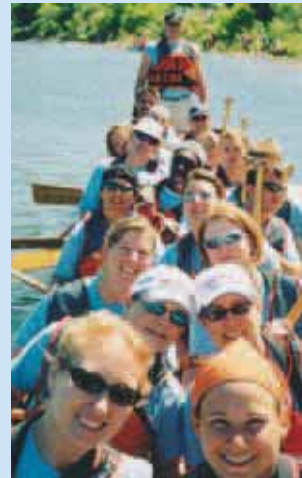
Meewasin Flying Canoe 2nd Place 2004