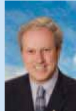
HON. PETER PREBBLE