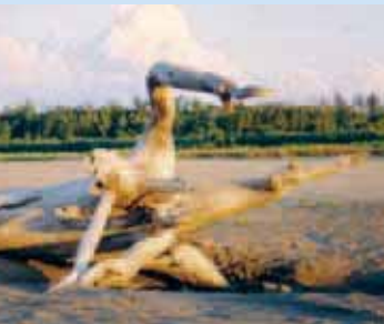
Driftwood Pelican on the bank of the South Saskatchewan