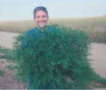
Meewasin Stewardship Summer Student