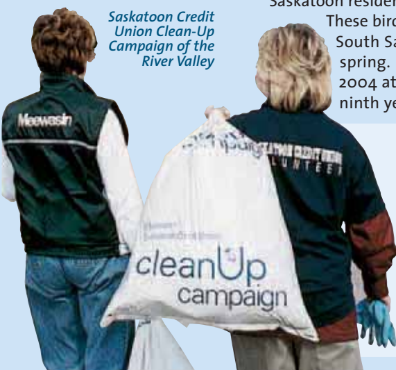
Saskatoon Credit Union Clean-Up Campaign of the River Valley