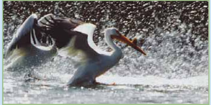
Pelicans at the Weir

South Saskatchewan River there are 25 square miles within the conservation zone.