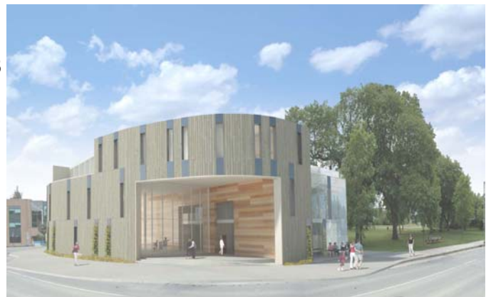
Moriyama & Teshima Architects March Schaffel Architects in Association

We have always known that Meewasin returns 20 cents on the dollar for Saskatoon and area. Of the $90 million Meewasin has spent in the valley in the last 29 years $18 has come from the local taxpayer. The rest has been leveraged through grants and fund development programs. We also know that every tourist we keep in Saskatoon for another day puts another $200 into the local economy which then has a multiplier effect. If we teach our youth to become stewards at a young age through Meewasin conservation programs, they will continue to be stewards when they become leaders and decision makers. If we showcase our expertise, others will want to access it. A new Meewasin Valley Centre would be a tremendous benefit to the community of greater Saskatoon by promoting health and wellness, environmental stewardship and sound business practices.