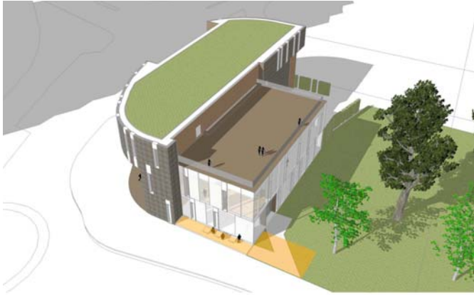
Moriyama & Teshima Architects March Schaffel Architects in Association

It was February 19, 1988 when Meewasin first moved into the old Rothman's building now the Meewasin Valley Centre with the goal to provide tourists and residents to Saskatoon with opportunities to learn about Saskatoon's history, the South Saskatchewan River and the future of the Meewasin Valley. The building has served well but is tired. More than ever Meewasin needs to continue to be the heart of the Meewasin Valley interpreting the cultural and natural story of past, present and future Saskatoon, adding the concepts of climate change, sustainability, water issues, developing a better understanding for residents and tourists so that they will become stewards of the entire Saskatchewan River Basin.