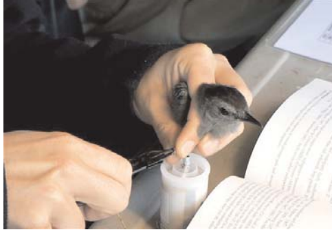
A Gray Catbird being banded at Beaver Creek

This summer Beaver Creek Conservation Area completed its pilot year as a member of a bird banding program with The Institute For Birds Populations, in California called Monitoring Avian Productivity and Survivorship (MAPS). Beaver Creek is one of over 500 participating members throughout Canada, Mexico and the continental United States. All have enlisted to help monitor the vital rates and population dynamics of landbirds and play a major role in aiding in the conservation of avian diversity in North America.